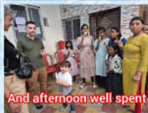
And afternoon well spent